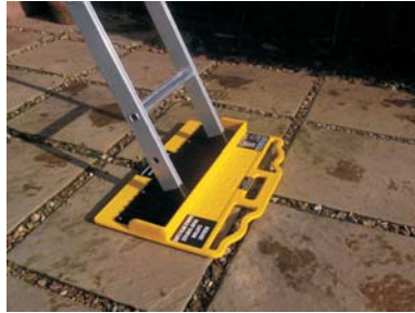
LADDER M8rix Professional