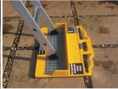
LADDER M8rix Industrial