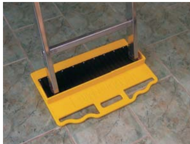
LADDER M8rix Interior