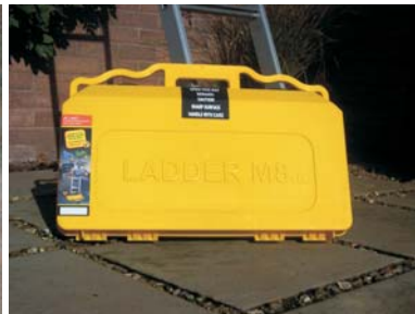
LADDER M8rix Carry Case