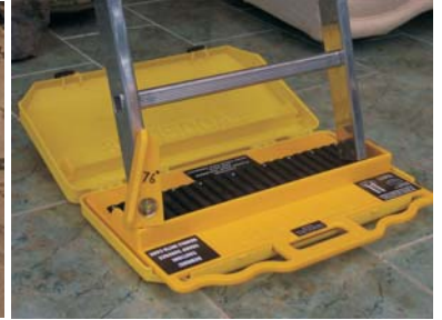
LADDER M8rix Pro-Plus